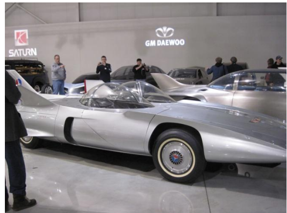
GM Heritage Museum