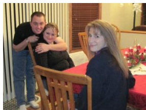
2009 WMFC Christmas Party

January brought a couple of club outings, starting with our monthly "Rock-n-Bowl" night. The group met at the Fairlane Lanes in Grandville for a night of strikes, gutters and new friendships. It's always fun to have first timers join us...even if you can't break 100!!