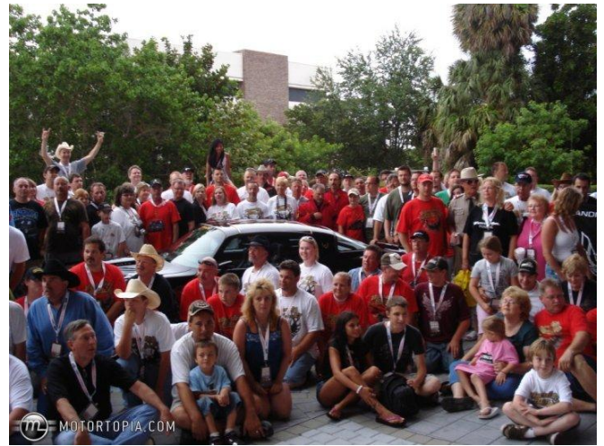
The group around Burt Reynolds' Trans Am in Jupiter, FL

in honor of the Bandit Run. We all had special parking privileges outside of the Burt Reynolds museum. There was a live band, food booths and even a live auction! It was flattering to see the 100's of locals who came out to see all the Trans Ams and all the media coverage that was there, too. Yes, Jupiter really knew how to treat the Runners.