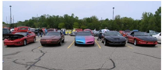
Photo of WMFC TAs at the Burn Survivor Show.