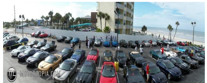
Hotel parking lot in Daytona Beach, FL

Monday morning found us leaving the wonderful town of Tifton, GA and heading south to Daytona Beach, FL. On our way to Daytona, the whole group stopped in Ocala, FL to tour the Don Garlits museum of Drag Racing. I had never heard of Don Garlit but was very impressed with the cars and the concepts that I saw in his museum. He was a true pioneer in Drag Racing. The drive to Daytona took us off the "usual" route that most people would take. We really got to see the rural yet beautiful side of Florida.