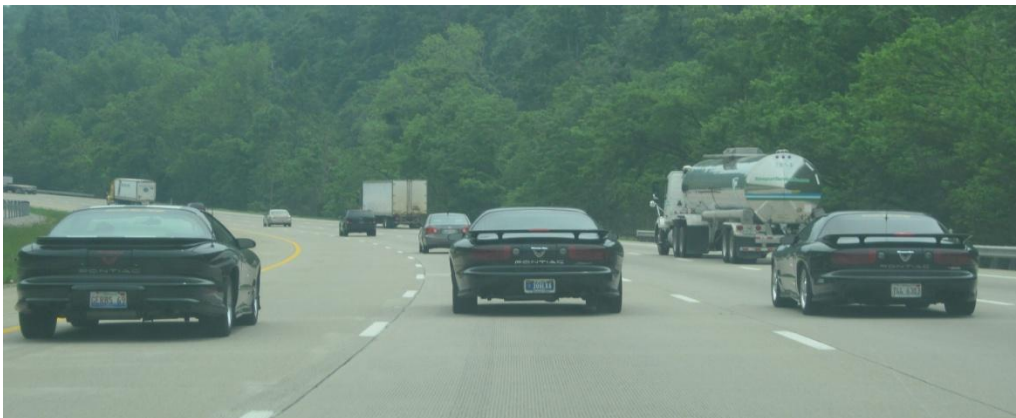
BANDIT RUN 2010

So, now the official Bandit Run was over. I still had 2 nights booked at Disney. I did spend one night with all the runners...talking about the run, the good times, the mishaps, all the events along the way. It was a good night, yet bittersweet. For most of the runners were going back home in the morning. We all said our good-byes and promised to keep in touch...and we will, this is a tight group. This was an experience I will treasure forever. And you can bet I'll be on the Run again next year!!