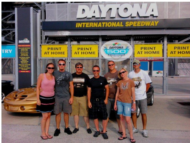
Daytona International Speedway!!!

Tuesday was our second day in Daytona and was a free day to do any sight seeing around town on your own. My group decided to go out to the Daytona 500 Race track and get some good shots of the cars by the sign. They turned out really nice! Then that night we had another car show to go to. This time at the local Hooters. I wasn't too crazy about going to Hooters, but it turned out to be a great time! The parking lot was full of Trans Ams, the locals all came out to gush over our cars and the Hooters staff went out of their way to help us. The whole experience was overwhelming. And yes...I did leave there with a Hooters tank top!!